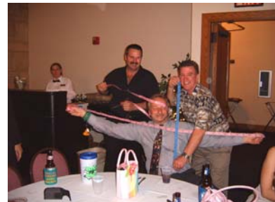
DO WE HAVE A WINNER?