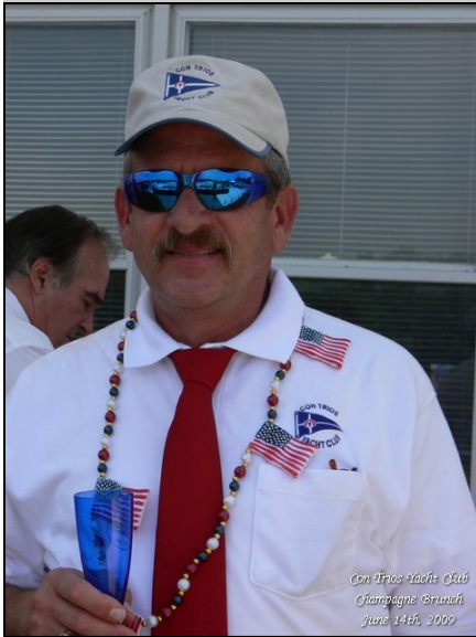
Con Trios Yacht Club Champagne Branch June 14th, 2009